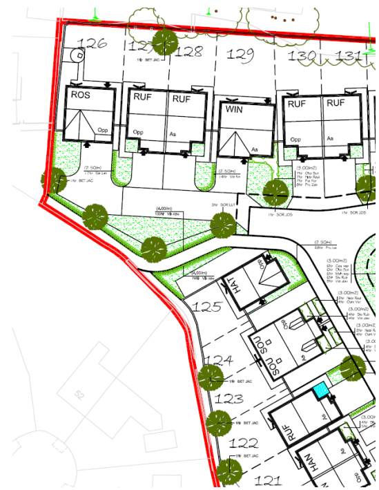
Image 4: Excerpt from landscape plan detailing location of new planting

3.5.6 The proposed level of planting and chosen species have resulted from dialogue between the developer, planning section and arboricultural consultants acting for both parties. Furthermore, given the ratio of planting, the proposals are consistent with Policy 9 (part 14) which indicates that where tree removal can be justified planning conditions will require an equivalent number or more trees to be planted on or near the site.